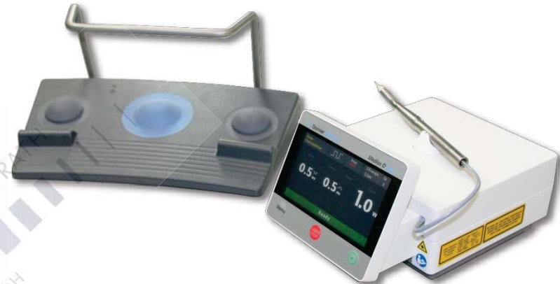
Dornier Medilas D Opal standard