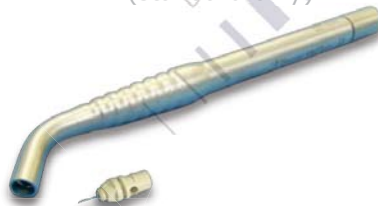
sapphire handpiece (standard only)