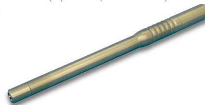
bleaching handpiece (optional, eco + std)