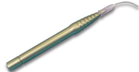
fiber handpiece (eco + std, IDS 2013)