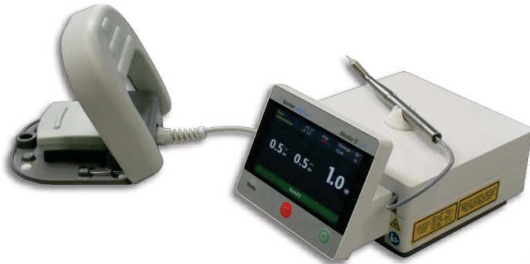
Dornier Medilas D Opal economy